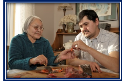
Inuit Family eating traditional food.

Strong Arctic communities, the environment, and sustainable economic development of the North are important to Northerners and Canada as a whole. The Department's role is to support the aspirations of Northerners, including: political evolution, healthy people and communities, sustainable economies, environmental protection, and increased capacity to reduce, respond and adapt to climate change. In 2019–20, the Department will continue to: