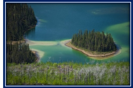
Northern Contaminants Program – Little Fox Lake.

For more information on CIRNAC's plans, priorities and the planned results, see the "Planned results" section of this report.