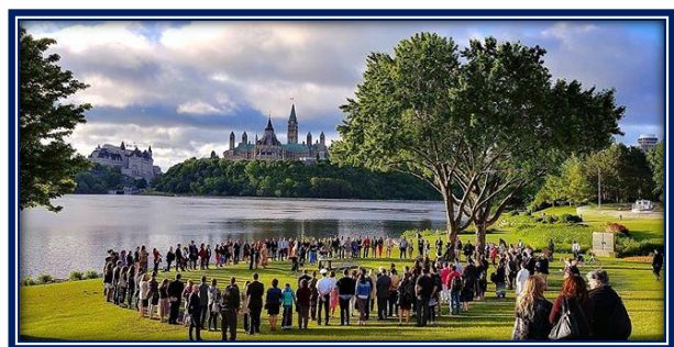
Sunrise Ceremony, Gatineau, Quebec

To renew the relationship, past injustices must be recognized and resolved and the paternalistic practice of developing priorities and solutions without Indigenous peoples must be abandoned. In the year ahead, the Department will: